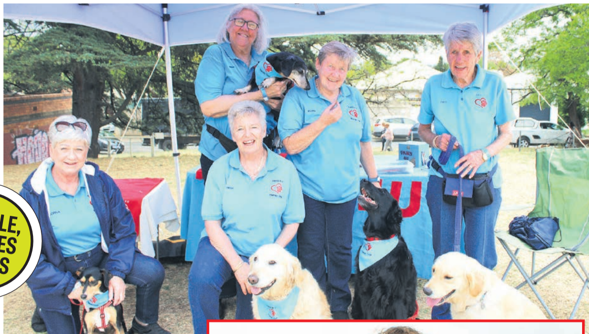
The NPO Paws 4 U members with therapy dogs.