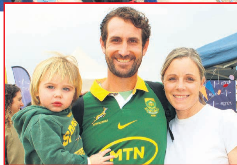
The Seegars family at the village fair.