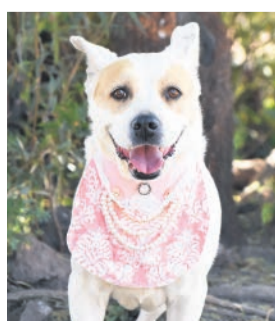
Lady is a 9-year-old female mixed breed.