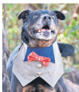
Oscar is a 1-year-old male mixed breed.