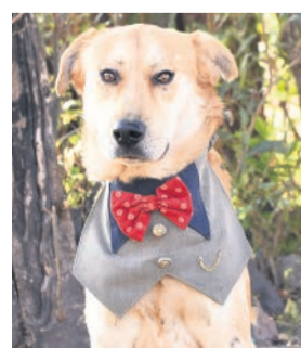
Woody is a 5-year-old male mixed breed.

Woodrock Animal Rescue has set up a Pup Pop-Up centre at The Garden Shop in Parktown North. Locals are invited to visit the shop between 09:00 and 14:00 every Saturday and Sunday to view their selection of adorable dogs. If you would like to adopt an animal, you will be required to fill out a screening questionnaire and have a home visit before the dog can be taken home. The cost of the adoption is R1 850 for a puppy, and R1 650 for an adult dog, which includes vaccinations, de-worming, flea treatment, microchipping, and sterilisation. Should the puppy not be ready for sterilisation at the time of going home, Woodrock will provide a sterilisation certificate to be claimed by one of our affiliated vets. Proof of sterilisation must be sent to Woodrock. If you adopt a second adult dog you will receive a 25% discount on the total fee. For more information, call 071 420 9868 or 082 925 3133, or email hello@woodrockanimalrescue.co.za